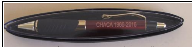
Commemorative 50 Year Pen. $5.00. (in case).