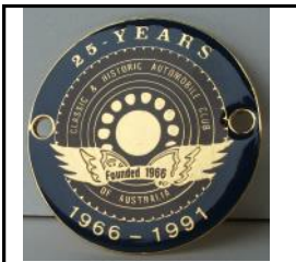
25 Year Anniversary Badge....$5.00 (65mm. diameter)

The following items are for sale to members. Contact Property Officer, Eddie Reynolds at meetings or phone (03) 97701231 or 0429142460