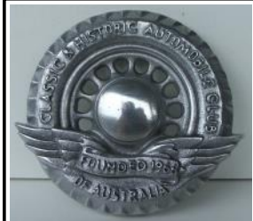
Bumper Bar Badge.....$40.00 (100mm. Diameter).