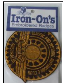
Iron-on Cloth Badge ...$2.00 (80mm.Diam).