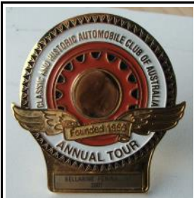
Early Annual Tour Badges. $2.00each.