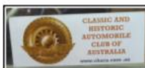
Club Decals. $2.00 each