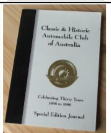
30 Year Anniversary Book $10.00