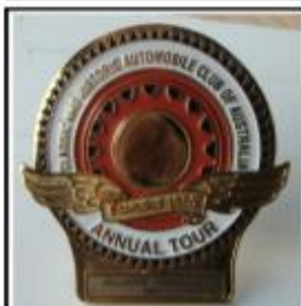
Early Annual Tour Badges. $2.00each.