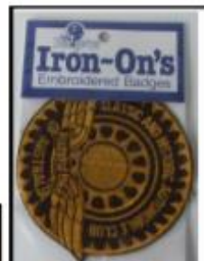
Iron-on Cloth Badge ...$2.00 (80mm.Diam).