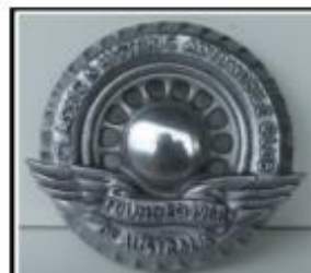
Bumper Bar Badge.....$40.00