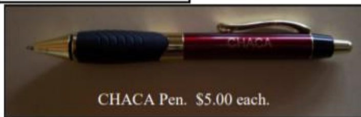
CHACA Pen. $5.00 each.