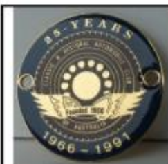
25 Year Anniversary Badge.....$5.00 (65mm. diameter)