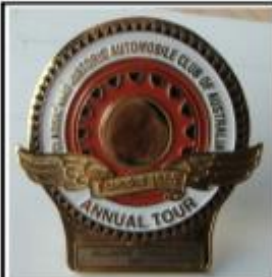
Early Annual Tour Badges. $2.00each.