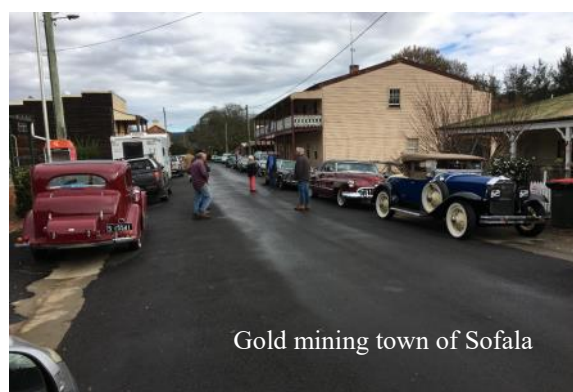
Gold mining town of Sofala

Post Tour – Thursday 26th May: Today we headed for the township of Sofala about 44kms north of Bathurst. The road was very undulating with some very steep climbs and descents but an enjoyable drive. Sofala is Australia’s oldest surviving gold mining town. Gold was discovered in Sofala in 1851 and there is still gold to be discovered. The town has only a population of 208 and has many quaint old homes and buildings. This was an opportune place to have a coffee as the weather had turned to drizzle.