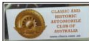
Club Decals. $2.00 each