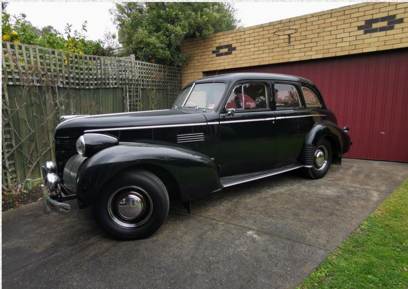
RAY'S 1939 PONTIAC