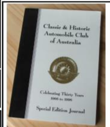
30 Year Anniversary Book $10.00