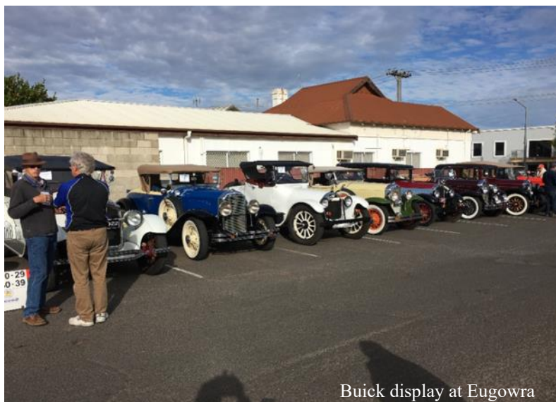
Buick display at Eugowra

meeting and hand feeding an alpaca and visiting the gallery. Morning tea was provided. We then travelled onto Peak Hill and visited the Peak Hill Open Cut Gold Mine. Gold was discovered at Peak Hill in 1889. The mine ceased production and was closed in 2002. After a quick look around Peak Hill we headed to Parkes and booked into the North Parkes Motel. We then unloaded the Buick off the trailer ready for the next two days of activities. That night dinner was our own arrangements.