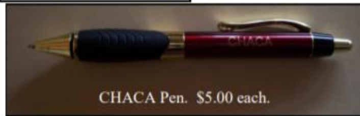
CHACA Pen. $5.00 each.