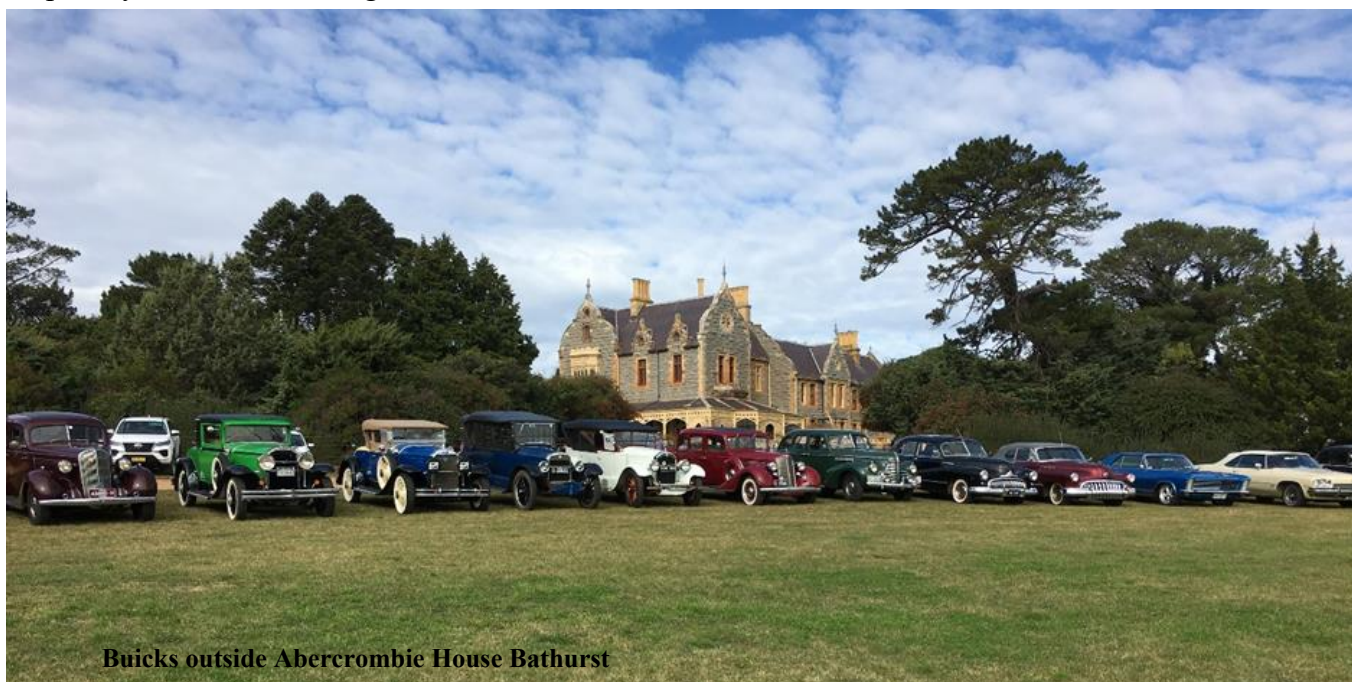
Buicks outside Abercrombie House Bathurst