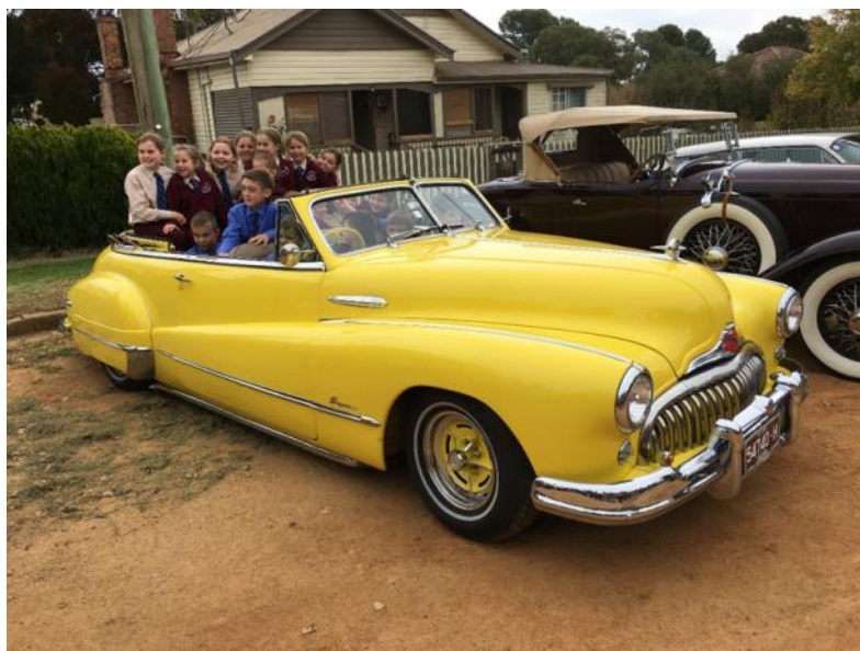
Yeoval Central School where the school children had a great time viewing and asking questions about the cars.

ACT – 1, W.A. – 1, Tasmania – 1, S.Australia. – 3, Queensland – 12, Victoria – 15 N.S.W. – 36.