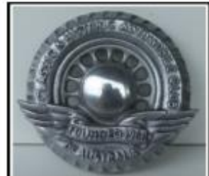
Bumper Bar Badge.....$40.00