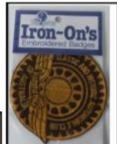
Iron-on Cloth Badge ...$2.00 (80mm.Diam).