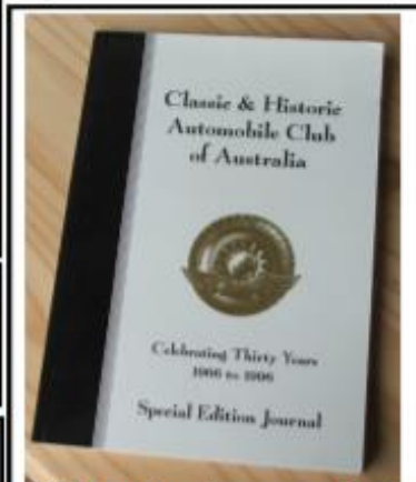
30 Year Anniversary Book $10.00