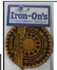
Iron-on Cloth Badge ...$2.00 (80mm.Diam).