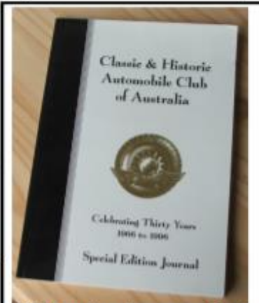
30 Year Anniversary Book $10.00