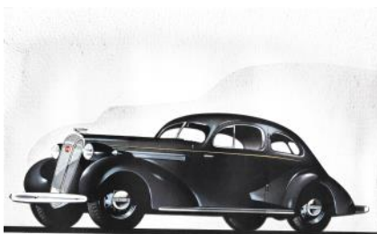
The Century Coupe. It stands as high as a man's chest, and its hood is as high as a man's head. The car is a masterpiece of design and engineering, and it is a true work of art. It is a car that is built to last, and it is a car that is built to be driven. It is a car that is built to be a part of your life, and it is a car that is built to be a part of your history.

The images are to show what I have to trade. 1936 Buick, 1936 Chevrolet Thanks, Scott (0123)