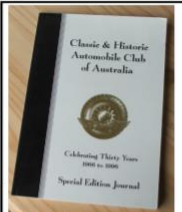
30 Year Anniversary Book $10.00